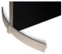
Feet Setting: Side 1