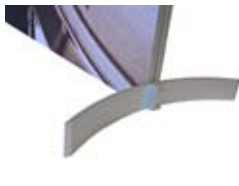
Feet Setting: Side 2