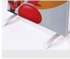
Feet Setting: Bottom