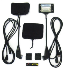
*Optional 200 watt halogen lights