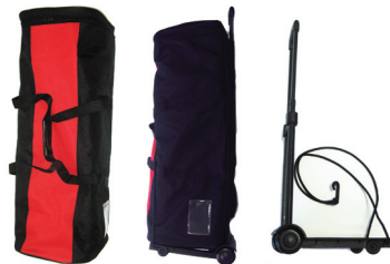
*Package includes padded nylon travel bag